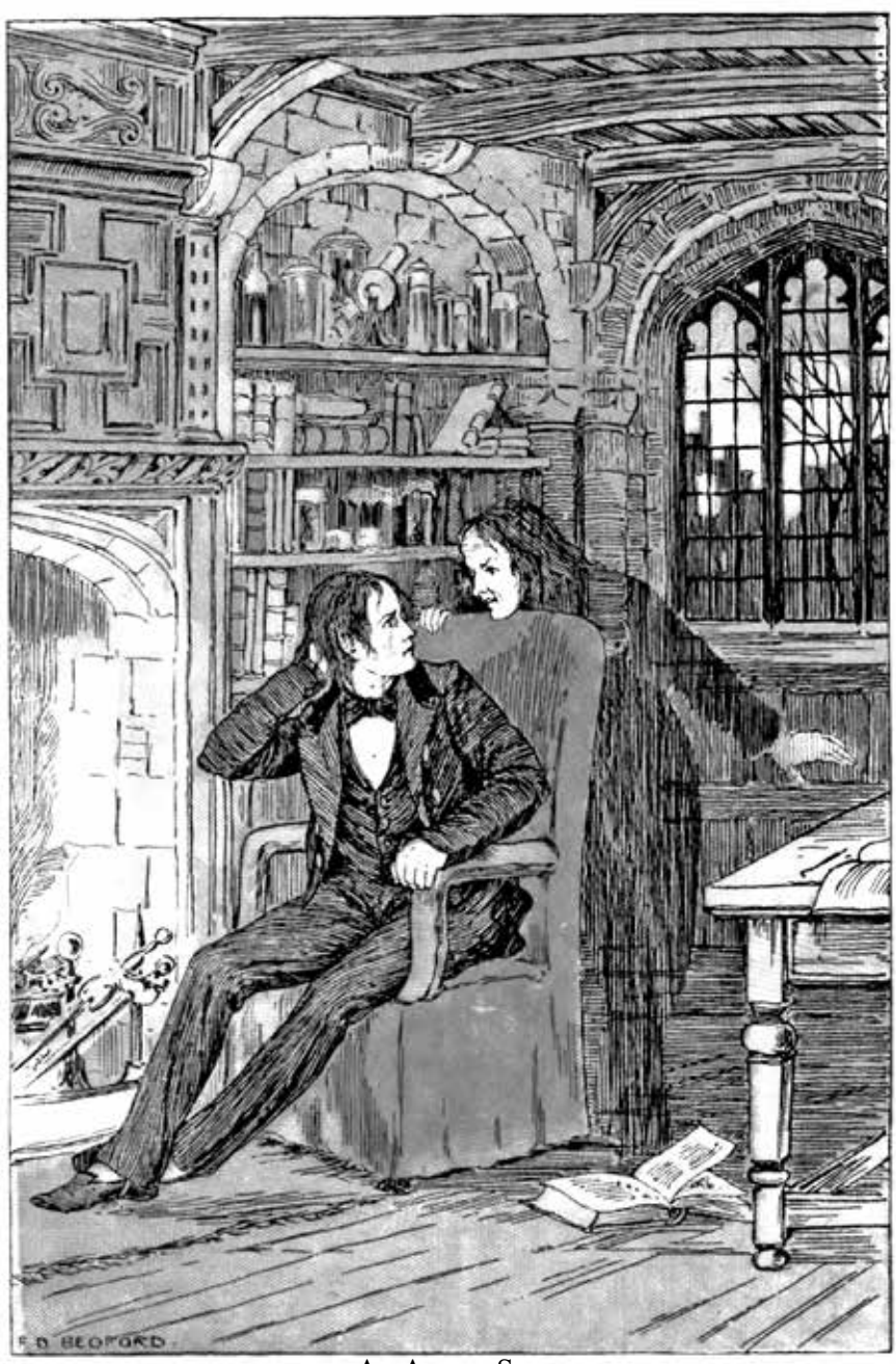
An Awful Survey.